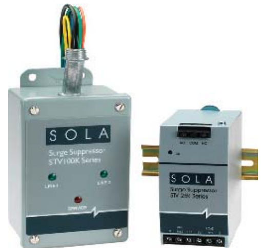
TVSS STV 100K & STV25K

Transient Voltage Surge Suppressors (TVSS) - provide the simplest and least expensive way to condition power. These units clamp transient impulses (spikes) to a level that is safe for the electronic load. Employing an entire facility protection strategy will safeguard the electrical system against most transients. Multi-stage protection entails using TVSS at the service entrance, sub-panel and at the point of use. This co-ordination of devices provides the lowest possible let through voltage to the equipment.