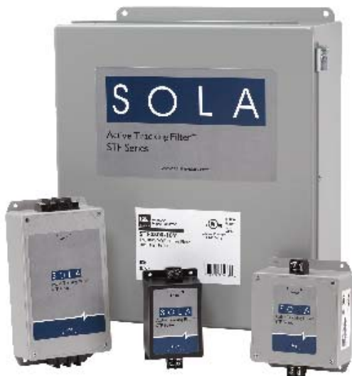
STF Series Active Tracking Filters

Filters - provide protection against low-voltage high-frequency noises. Filters are designed to pass the fundamental frequency (typically 50 or 60Hz) and reject higher frequency noise such as conducted electromagnetic interference (EMI) and radio frequency interference (RFI). Harmonic current filters prevent the harmonic content of non-linear loads from being fed back into the power source.