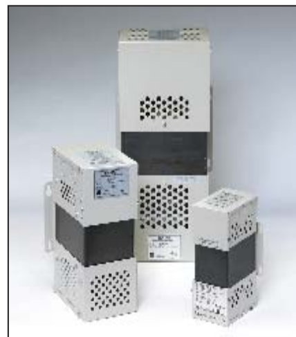
Constant Voltage Transformers